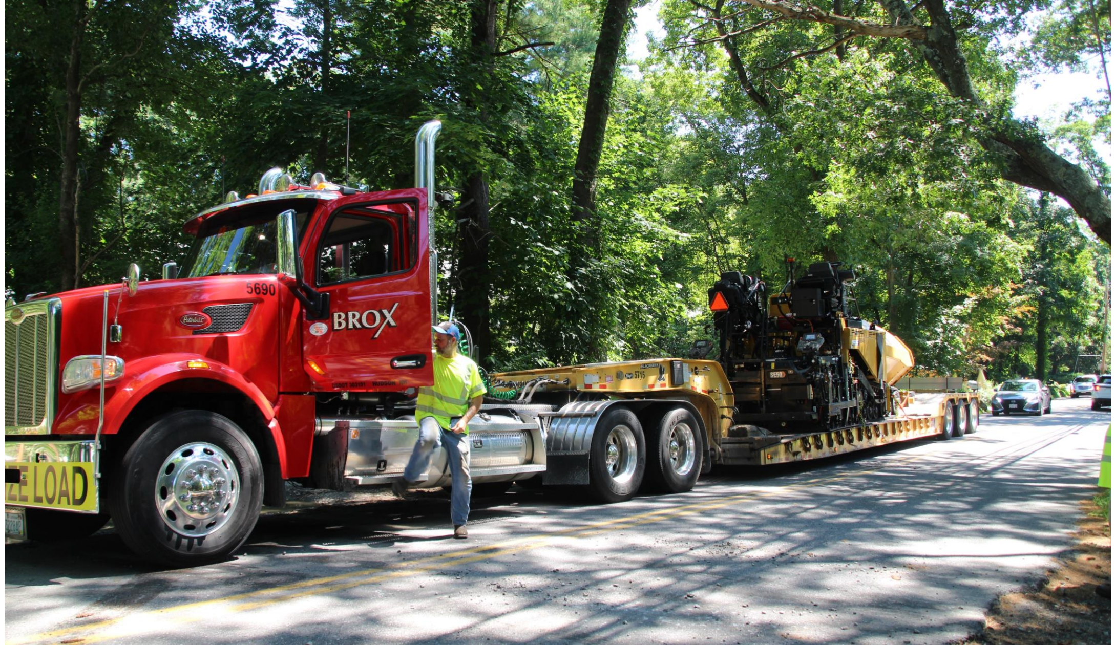
Paver transported to Old Lancaster Rd. on north side of Hop Brook, as it is too heavy to cross the bridge.