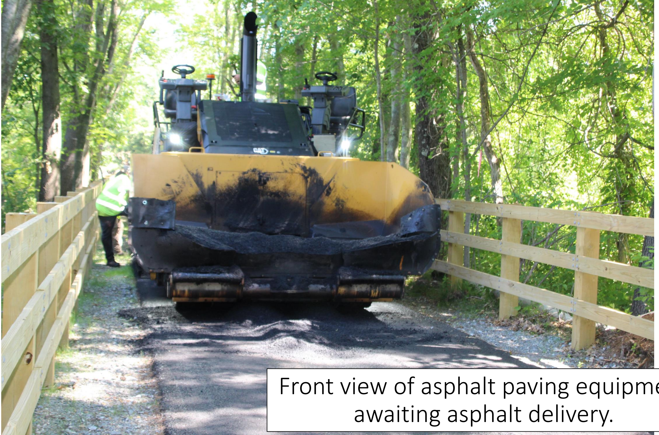
Front view of asphalt paving equipment awaiting asphalt delivery.