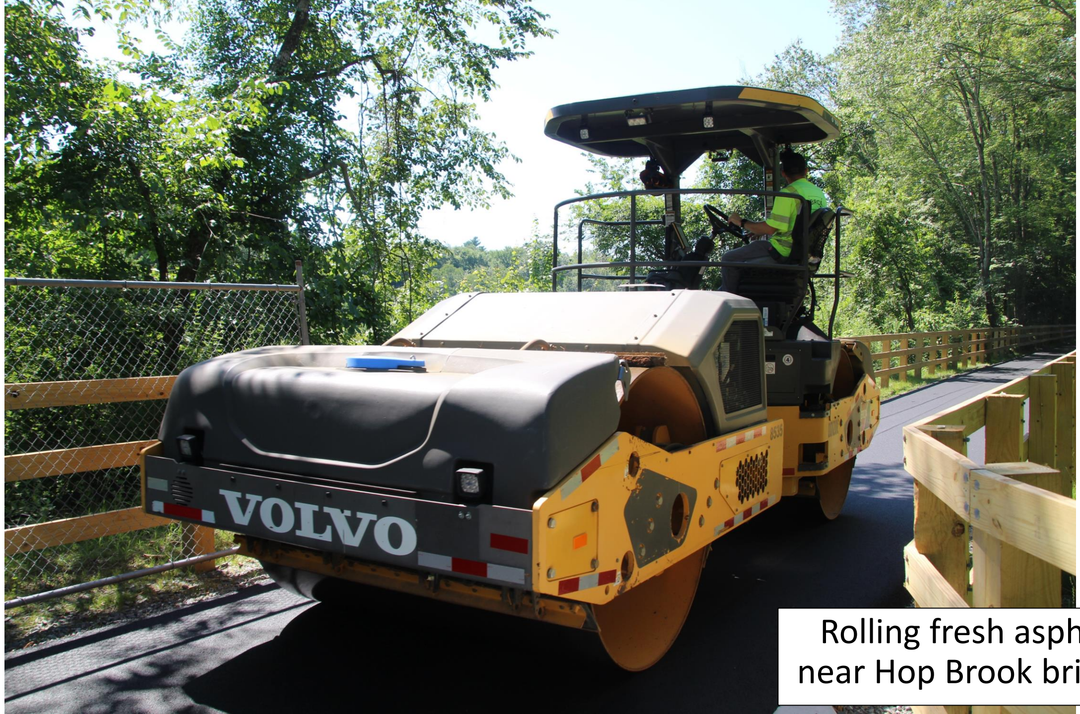
Rolling fresh asphalt near Hop Brook bridge.