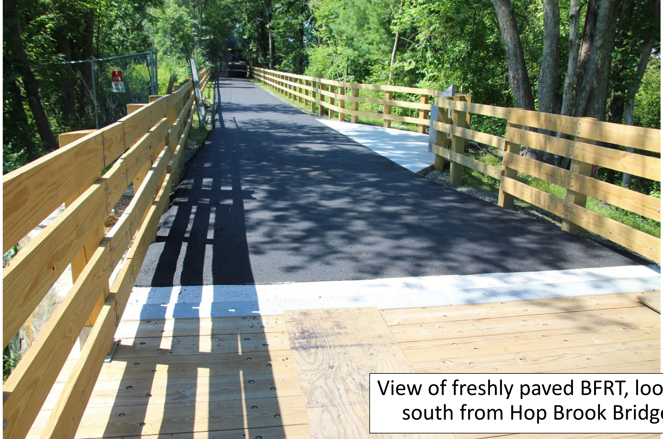
View of freshly paved BFRT, looking south from Hop Brook Bridge.