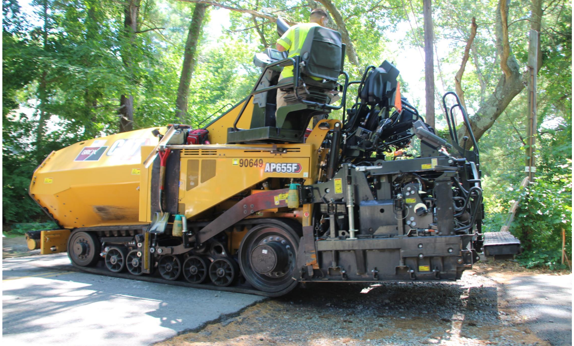
Paver backing down trail from Old Lancaster Rd. to start paving north of Hop Brook.