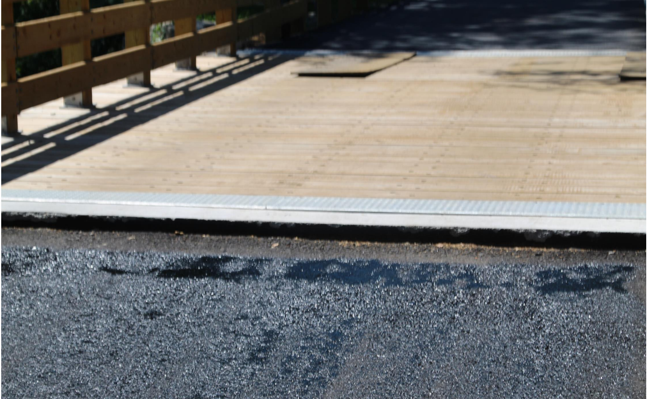
Spray binder on BFRT, new asphalt will be level with bridge deck.