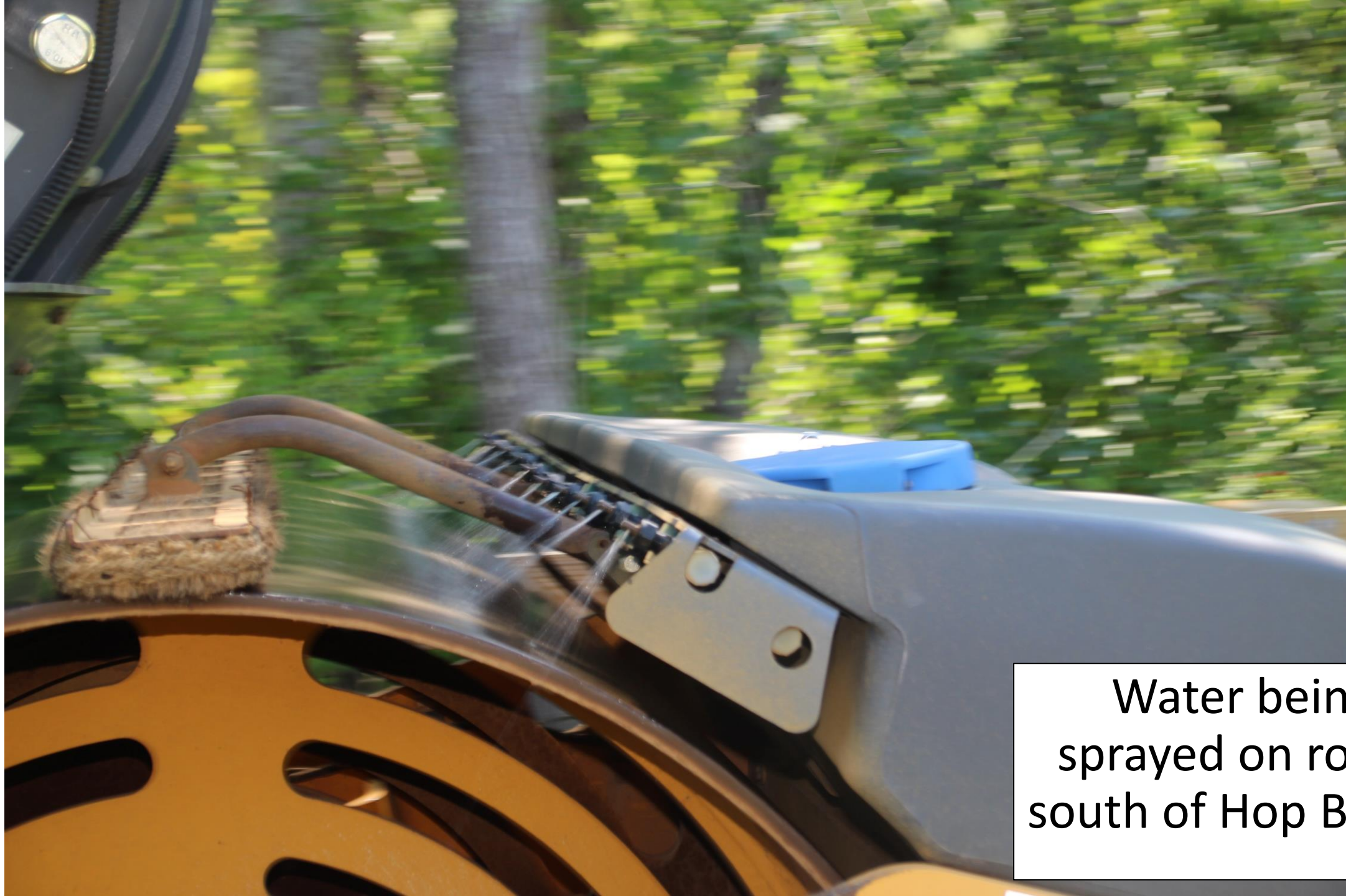
Water being sprayed on roller, south of Hop Brook.