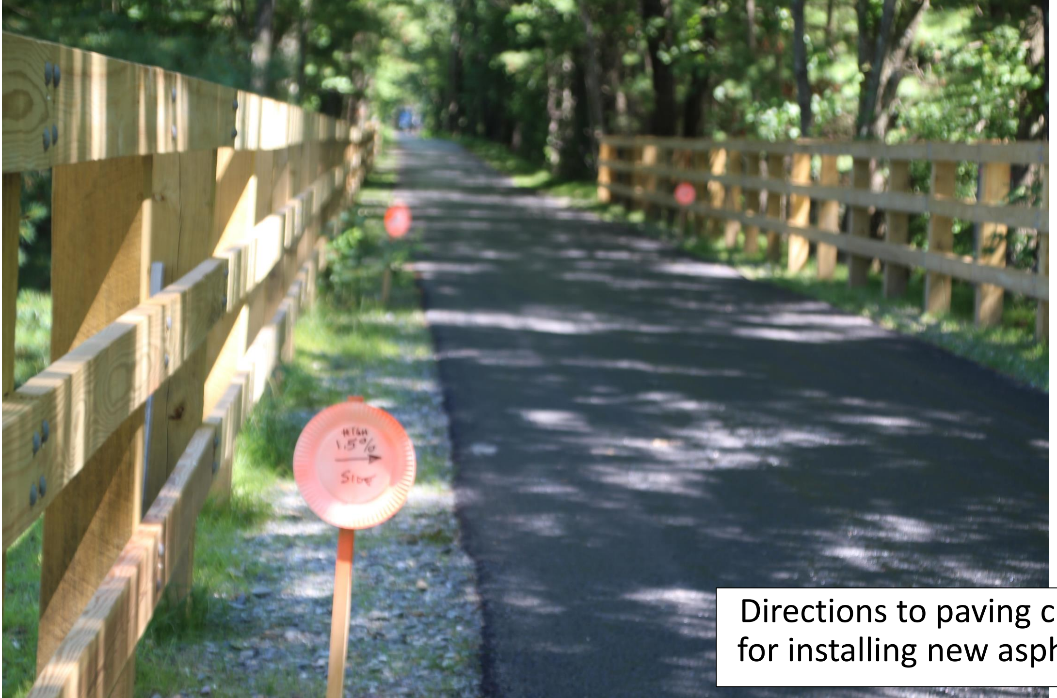
Directions to paving crew for installing new asphalt.