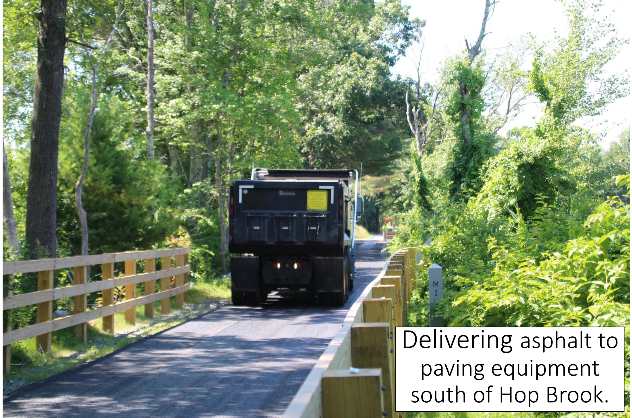
Delivering asphalt to paving equipment south of Hop Brook.