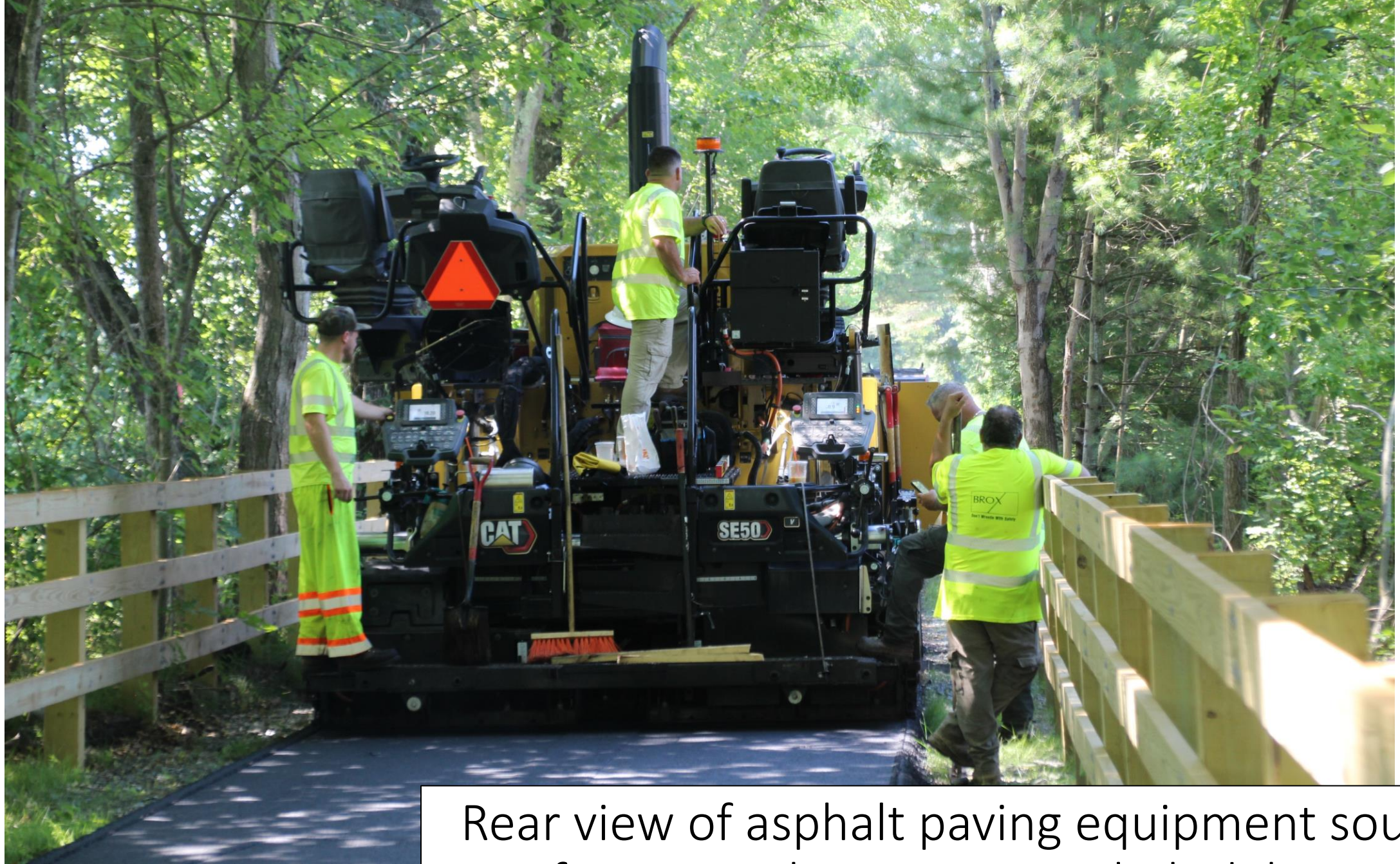
Rear view of asphalt paving equipment south of Hop Brook, awaiting asphalt delivery.