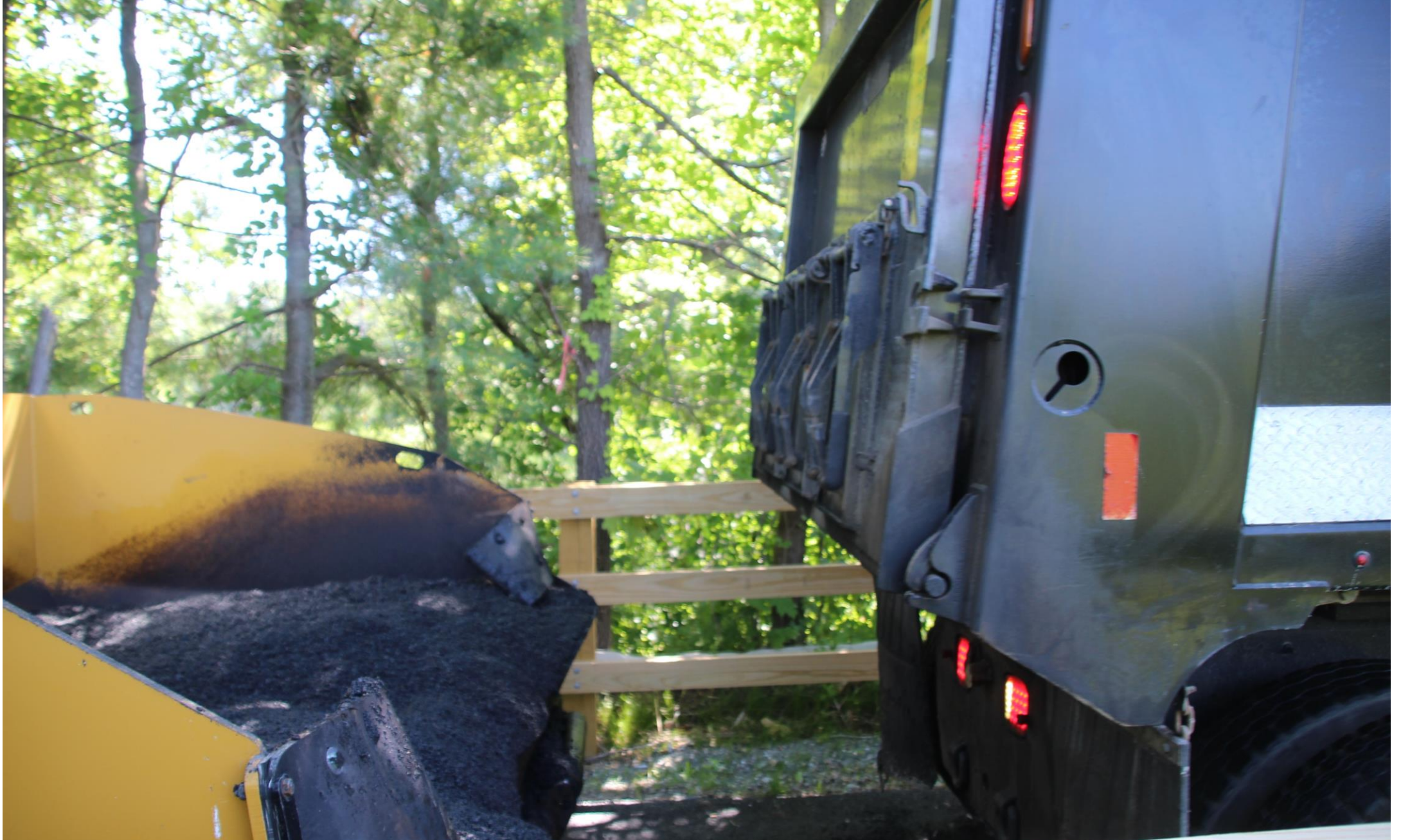
Delivering asphalt to paving equipment south of Hop Brook.