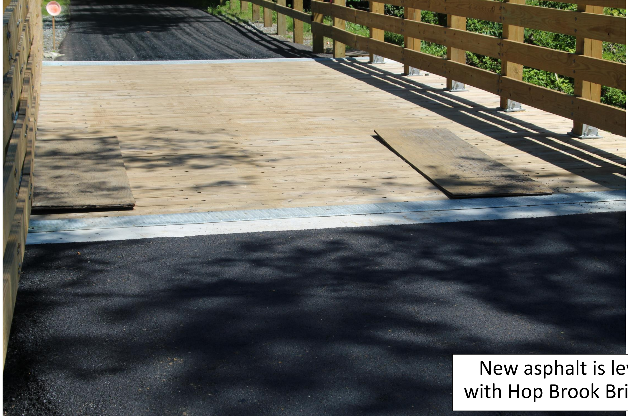
New asphalt is level with Hop Brook Bridge.