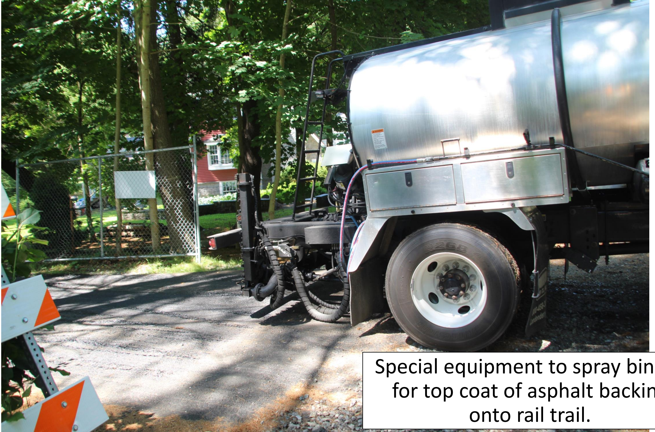
Special equipment to spray binder for top coat of asphalt backing onto rail trail.