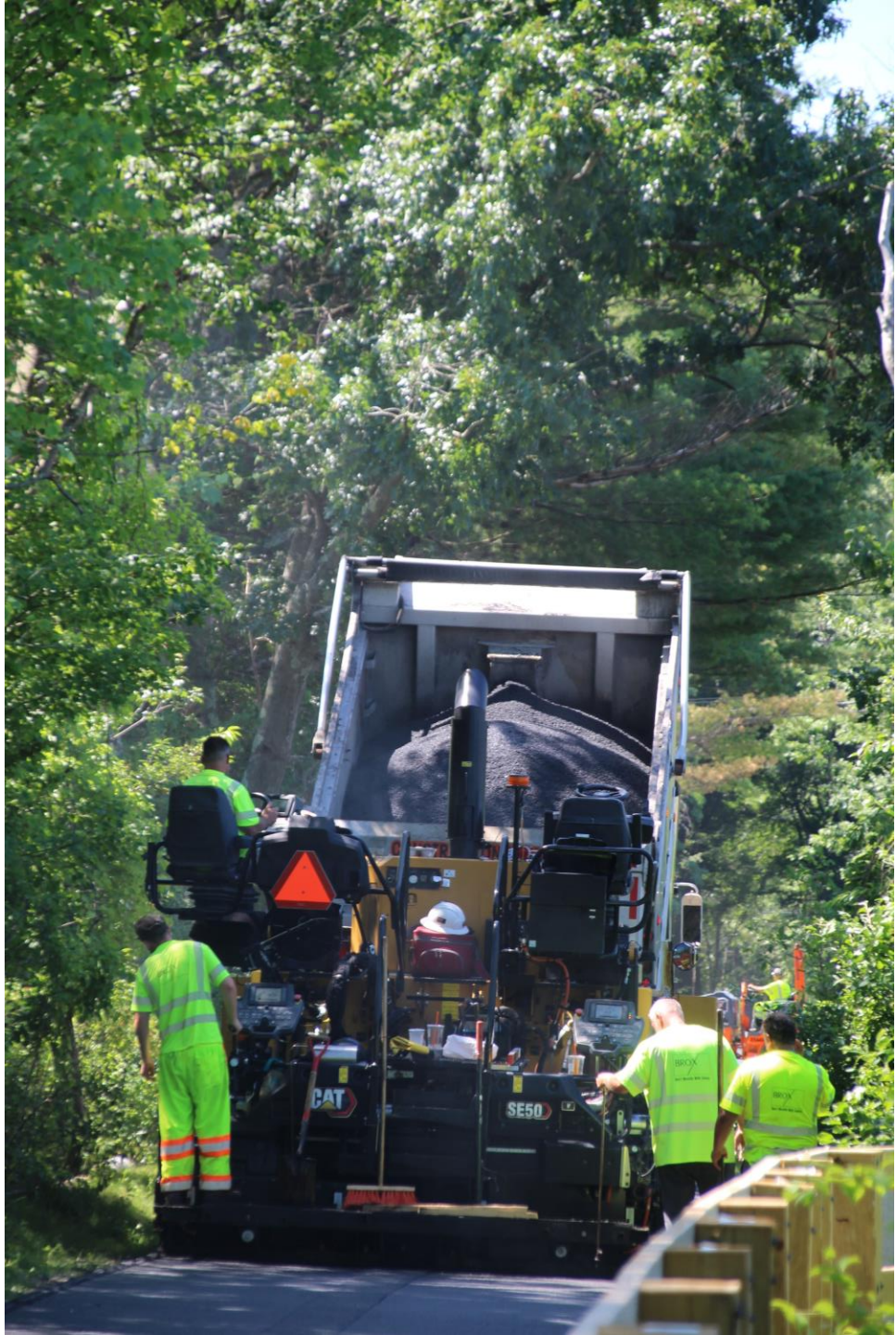
Paving while receiving hot asphalt.