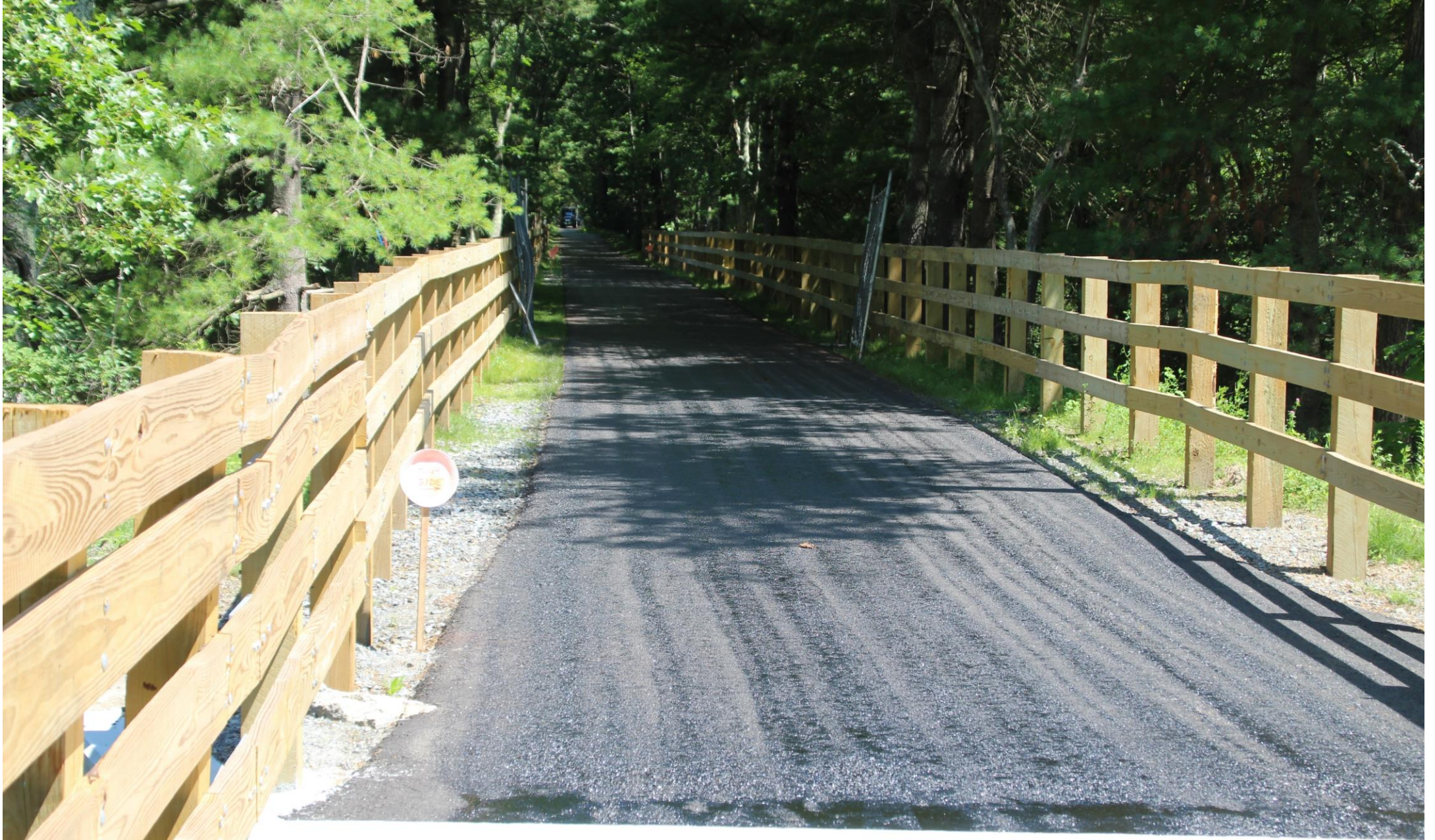
Spray binder on BFRT north of Hop Brook bridge.