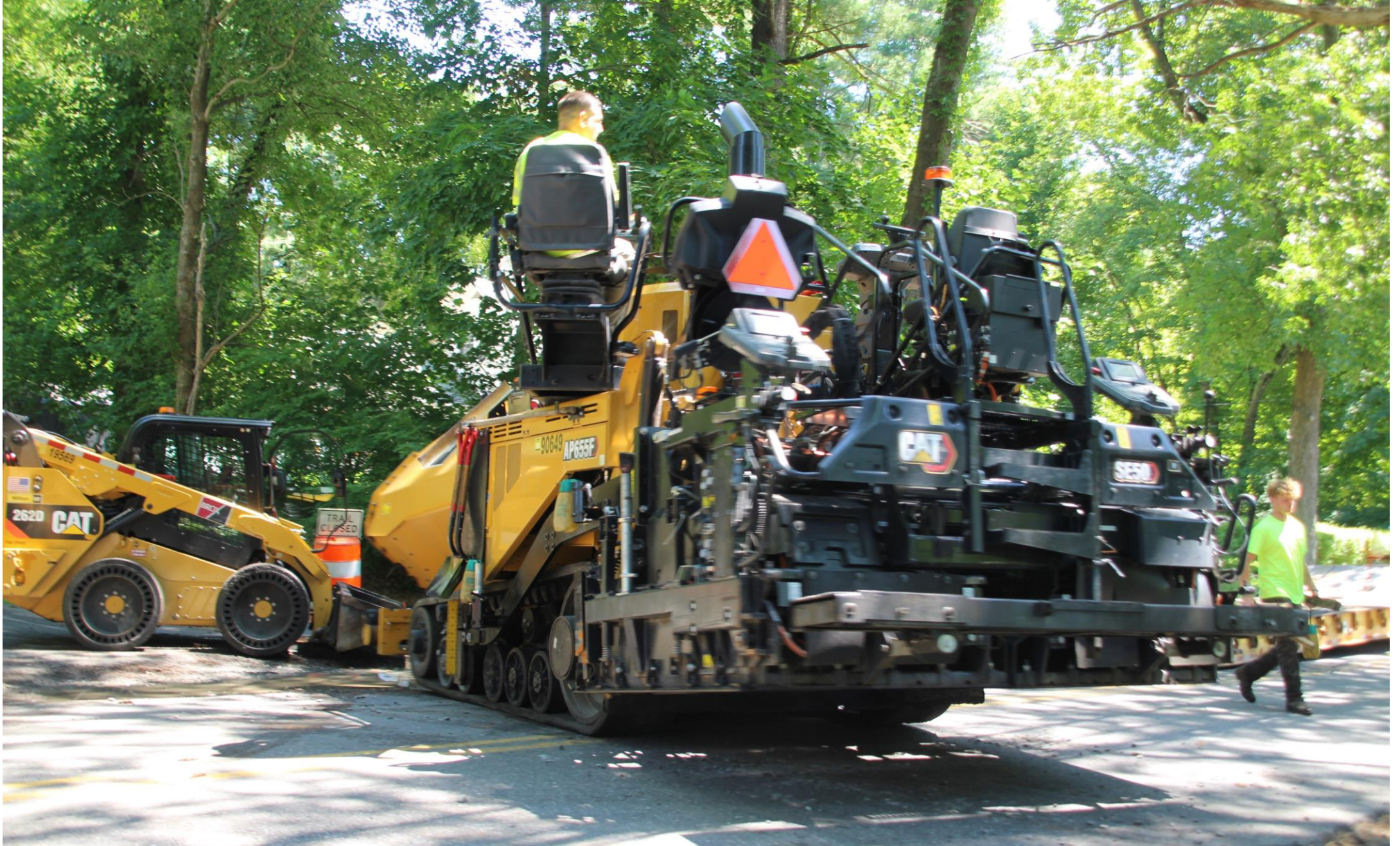
Backing down trail from Old Lancaster Rd. to start paving north of Hop Brook.