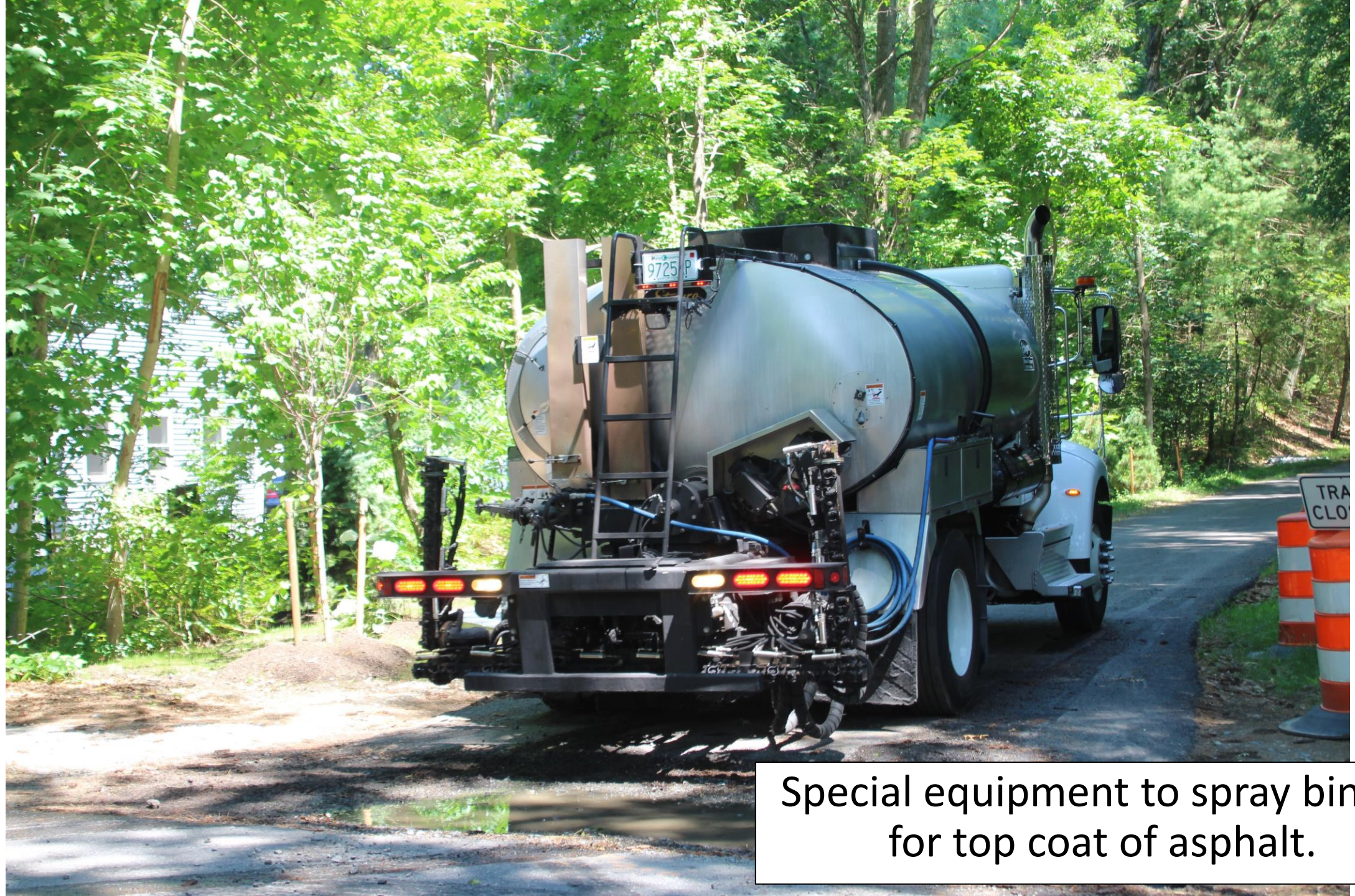
Special equipment to spray binder for top coat of asphalt.