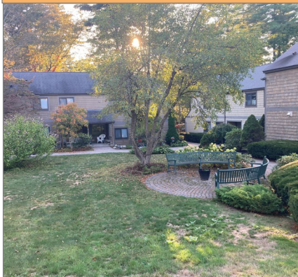
Musketahquid Senior Apartments